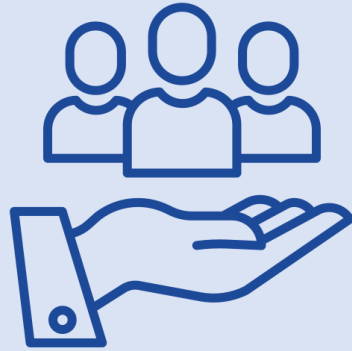
Changing demographic and need